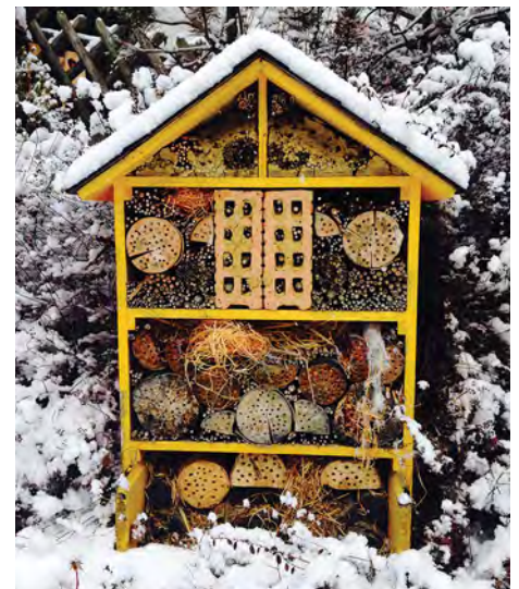
Bee hotel in winter.