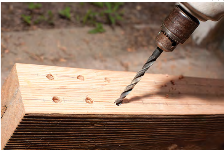
Long drill bits can be used to drill holes in wood blocks spaced about 3/4 inches apart.