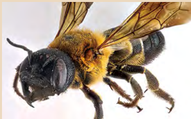
Giant resin bee ( Megachile sculpturalis )