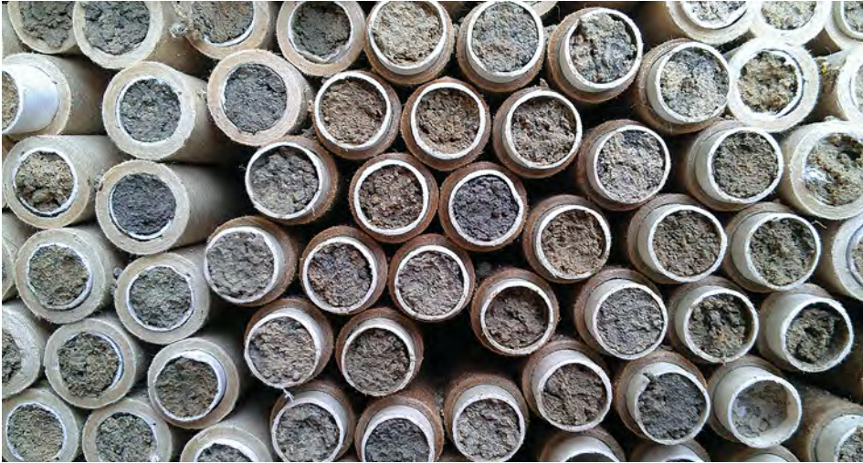
Completed mason bee nests.

nesting bees. If the nests are never cleaned, they can harbor bee pests and diseases, putting local bees at greater harm than if no nests had been provided.