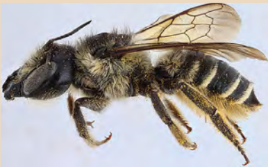
Unarmed leafcutter bee ( Megachile inermis )