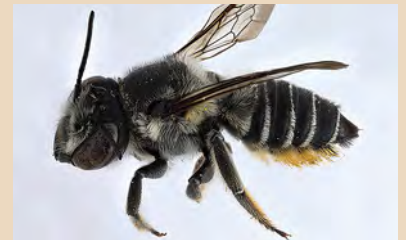
Flat-tailed leafcutter bee ( Megachile mendica )