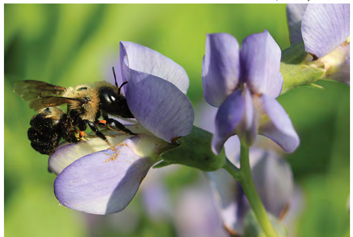
Bufflehead mason bee ( Osmia bucephala ) foraging on false indigo ( Baptisia sp.)