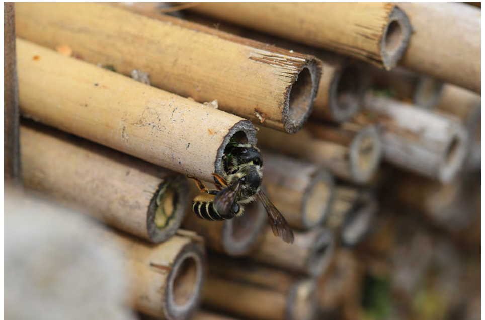
Jason Gibbs, University of Manitoba

About 30 percent of the 5,000 native bee species in North America build nests in a variety of aboveground cavities or tunnels. These can be beetle holes in wood, hollow or pithy plant stems, brush piles, standing snags, or cavities in human-made structures. There are two main kinds of cavity-nesting (tunnel-nesting) bees: mason bees ( Osmia species), which are mostly active in the spring, and leafcutter bees ( Megachile species), which are active in the summer. Both types are found across the U.S. and can provide important pollination services for fruits and vegetables. By providing them with nesting resources, people can manage some of these species to help