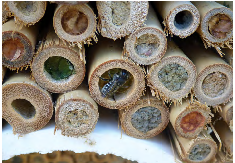
Leafcutter bee ( Megachile sp.) sealing her nest in bamboo tube.