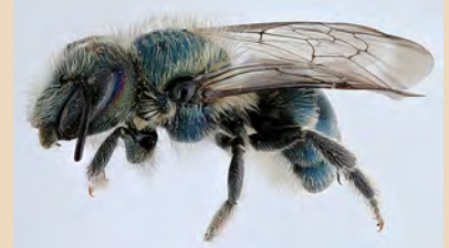
Small mason bee ( Osmia pumila )