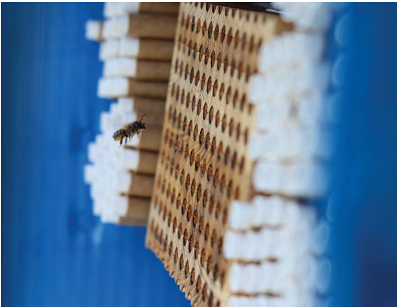
Mason bee building nests in a wood block.

conserve their populations in farms and home gardens. Bee hotels are one way to provide these resources.