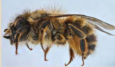
Japanese horn-faced bee ( Osmia cornifrons )