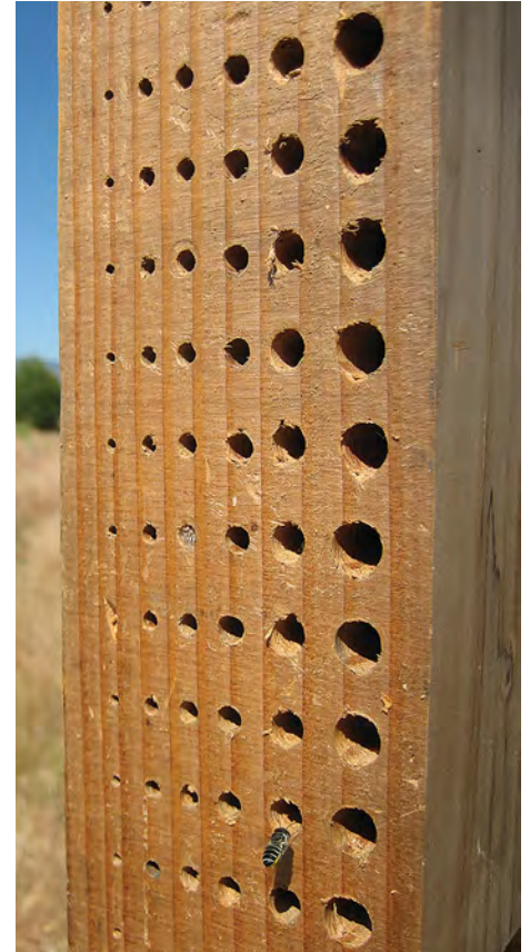
Wood block drilled with holes of various diameters to attract a diversity of stem-nesting bees.