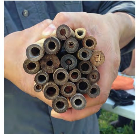
Bundle of bamboo tubes of various diameters to be used in a bee hotel.