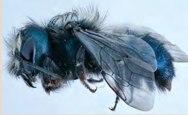
Blue orchard bee ( Osmia lignaria )