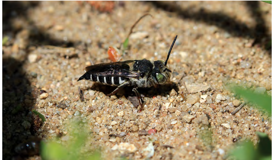
Cleptoparasitic bee to leafcutter bees, Coelioxys sodalis , rests on the ground.