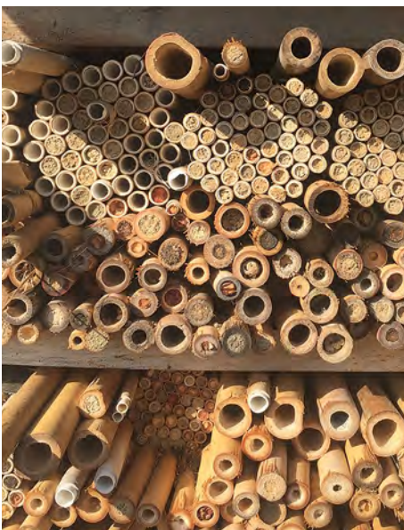
Example bee hotel designs using bamboo, wood blocks, and cardboard tubes.